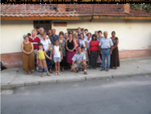
Preparing for the camp, and the camp itself. A lot of fun and games were played.